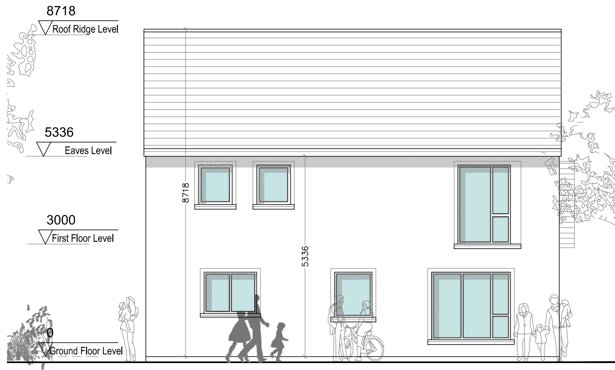
Proposed Rear Elevation SCALE 1:100 @ A3

* FINISHED FLOOR LEVELS - REFER TO SITE LAYOUT PLAN